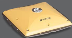
PG-S3 GNSS Antenna